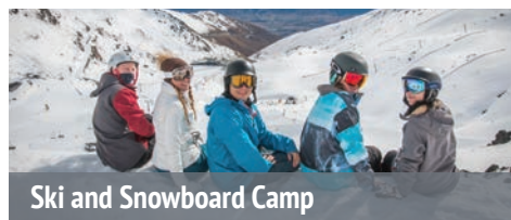
Ski and Snowboard Camp

Haka Educational Tours are the sole travel provider for NZ and Australian teams looking to take part in the most highly-anticipated event on South Africa's schoolboy rugby calendar.