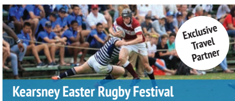
Kearsney Easter Rugby Festival

As well as amazing opportunities on the court, your team will have the chance to visit famous clubs, watch top class matches, and experience the cultural uniqueness of the USA.